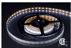
Non-waterproof and Waterproof LED Strips SMD5050-30 LED's per meter