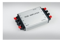
Amplifier for RGB Strips