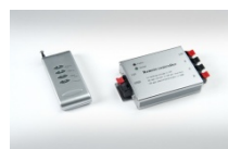
Radio Frequency RGB Controller w/ Remote • Very High Range • Pre-programmed