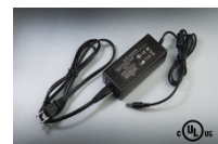
Transformer Comes in 2A, 4A, and 6A