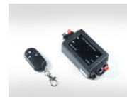
12V LED Dimmer with Remote Output Current: <8 A Power Output: 96 W