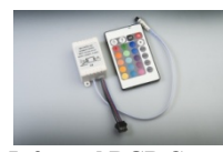
Infra-red RGB Controller w/ Remote Control • More Options in Choosing Colors • Pre-programmed