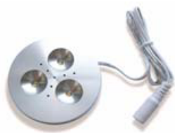
Under Cabinet Puck Lights