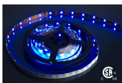
Non-waterproof and Waterproof LED RGB Strips