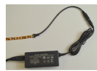
Strip to Transformer Connector