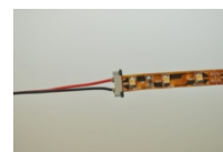
Wired Connector (Also available for RGB)