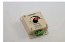
12V LED Dimmer Output Current: <8 A Power Output: 96 W